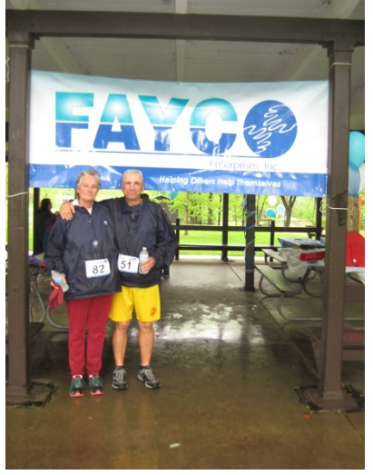
We even had participants from other states! This couple came in all the way from Georgia!