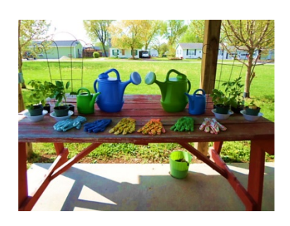
Growing Plants Helps Relieve Stress!

We would like to send a flowers. Research BIG Thank You to the Raymond/Lincolnwood High School FFA for making us 4 raised bed planters for our outdoor pavilion in Hillsboro! These planters were made from repurposed blue plastic barrels. They are being used to grow a variety of vegetables, herbs, and