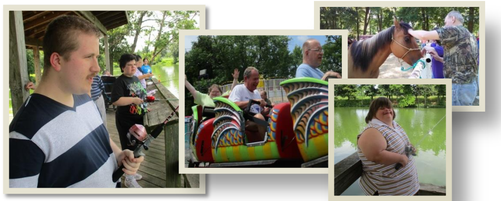
"Helping Others Help Themselves"

Summer time means the glow of fireflies, a big juicy slice of watermelon, long evenings, and you called it... FISHING! Here at FAYCO, we spend the summer fishing, learning how to take care of horses, and riding rides at the Highland Fair! Who doesn't love a ride or two or the popular lemonade shake-up drink and funnel cake?! We just love getting outdoors and making memories!