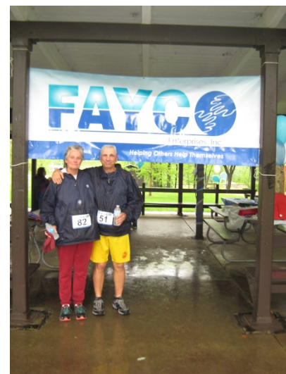
We even had participants from other states! This couple came in all the way from Georgia!