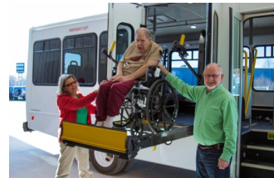
Our Newest Transportation Vehicles!