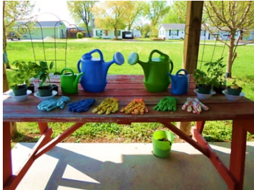
Growing Plants Helps Relieve Stress!

We would like to send a BIG Thank You to the Raymond/Lincolnwood High School FFA for making us 4 raised bed planters for our outdoor pavilion in Hillsboro! These planters were made from repurposed blue plastic barrels. They are being used to grow a variety of