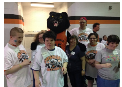
Everyone likes to pose in a picture with Hoguey the Panther!